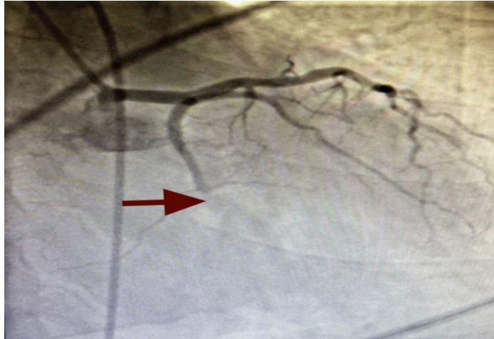
Figure 1. Right anterior oblique caudal view showing total occlusion of the circumflex artery (arrowhead)

recurrence of distal coronary leakage. The patient has suffered intermittent complete AV block. The temporary pacemaker was implanted, and a 2.0 x 4 cm Prestige coil was used to occlude distal CFX. Control injections confirmed total occlusion of CFX and no leakage ( Figure 3 ). Despite the lack of active coronary leakage and significant pericardial effusion, the patient continued to have mild hypotension and orthopnea. TTE performed the next day revealed a highly echogenic image of the hematoma around the right ventricular free wall, close to apex. Surgical removal of the hematoma resolved the patient's hypotension and orthopnea. The patient was advised to continue aspirin and atorvastatin for life and was discharged in good condition after seven days of hospitalization.